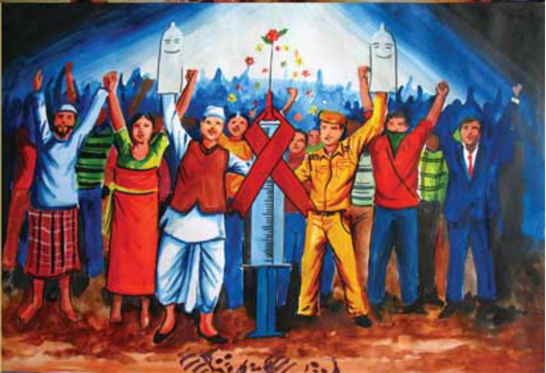
2ND PRIZE WINNER OF STATE LEVEL SPOT PAINTING COMPETITION ON THE OCCASION OF INTL AIDS CANDELELIGHT MEMORIAL DAY OBSERVANCE