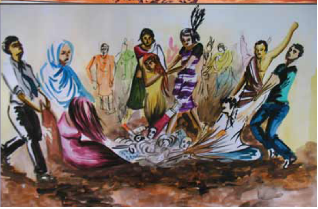
3RD PRIZE WINNER OF STATE LEVEL SPOT PAINTING COMPETITION ON THE OCCASION OF INTL AIDS CANDELELIGHT MEMORIAL DAY OBSERVANCE