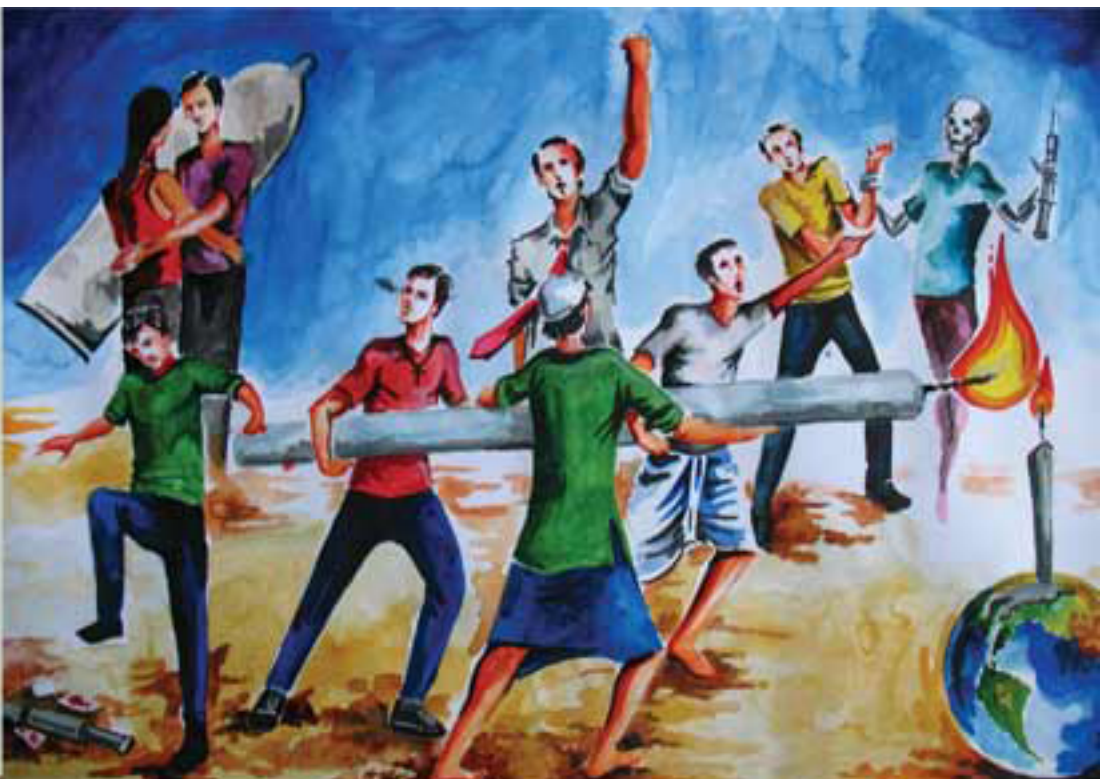
1ST PRIZE WINNER OF STATE LEVEL SPOT PAINTING COMPETITION ON THE OCCASION OF INTL AIDS CANDELELIGHT MEMORIAL DAY OBSERVANCE